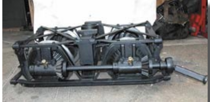
One of two rebuilt Shay trucks.