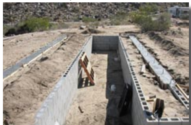
View of the Carbarn Pit with newly poured foundation walls on each side.