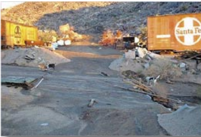
Sand from the wash covers the road adjacent to the Shop Car.

The damage shown occurred between 7-9PM Wednesday night August 27th; Pat Skrilets (our neighbor) took these photos early Thursday AM. Our flood control efforts paid off and little serious damage was done; we will learn from this event also. ☀