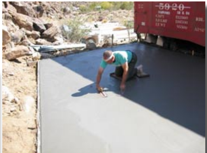
A closer look at "Shoeless" Bill Shepard performing the highly skilled task of finishing the concrete. This new Shop Car addition required over 10 yards of concrete, and will eventually have a roof over it. Plans call for this area to serve as a motor pool servicing bay and open-air woodshop.