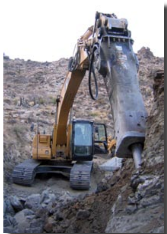
Hammering rock in the Grand Scale Railway loop.