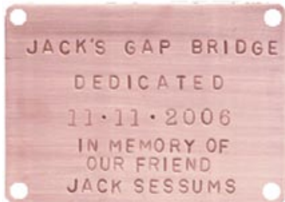
Dedication plate to be riveted to Bridge.